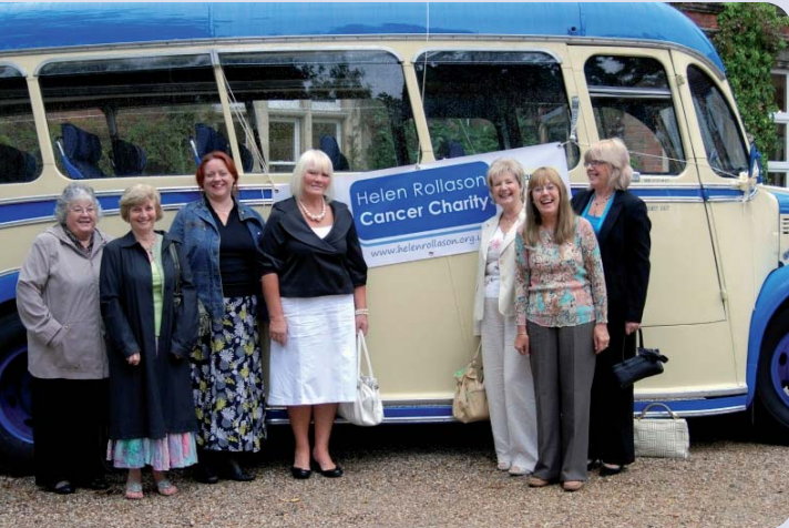
Ongar shop volunteers