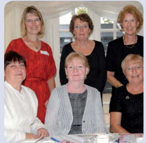
Danbury shop volunteers

their contribution has not gone unnoticed and we greatly value their continued support."