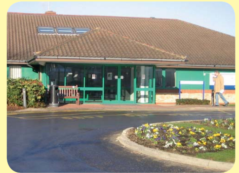
The Rivers Hospital in Sawbridgeworth where the new Hertfordshire Cancer Support Centre will be opened