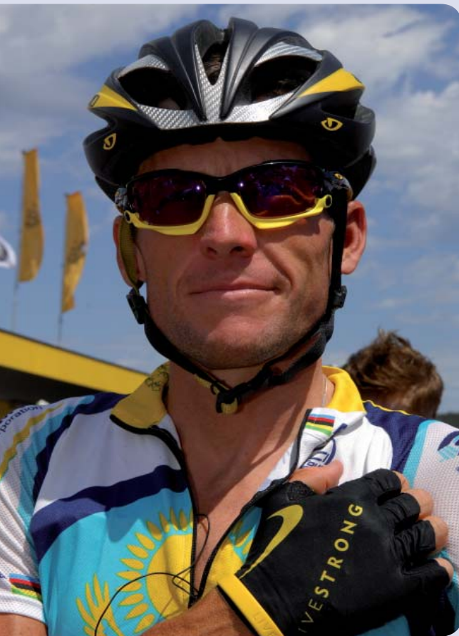
Lance Armstrong

Who could have ever predicted that seven time Tour de France winner Lance Armstrong would return to the saddle after retiring in 2007?