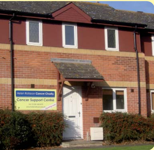
New Essex Cancer Support Centre at Broomfield Hospital

The new centres will be based on the same set of principals as our current centres with both locations offering complementary therapies to cancer patients.