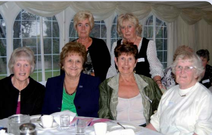
Braintree shop volunteers

attended to receive recognition for their hard work and effort. Guests enjoyed speeches made by charity workers in appreciation of their efforts, a live music performance and cream teas.