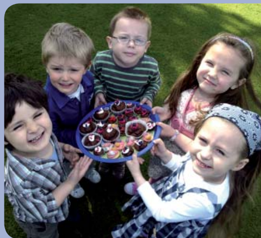
Youngsters enjoying the Easter party